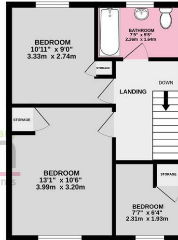
1ST FLOOR 395 sq.ft. (36.7 sq.m.) approx.